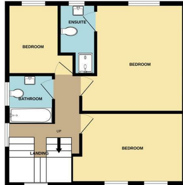
1ST FLOOR 518 sq.ft. (48.1 sq.m.) approx.